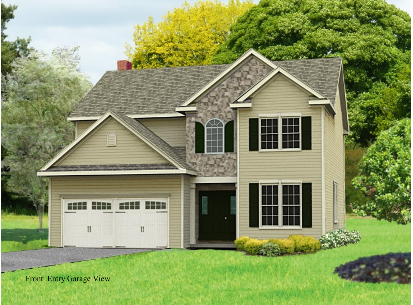
Front Entry Garage View

Main Level: 1000 Sq. Ft. Second Level: 1267 Sq. Ft. Total: 2267 Sq. Ft.